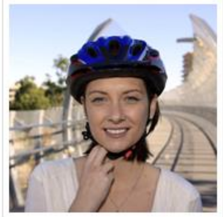
Allow two fingers between the helmet strap and your chin.