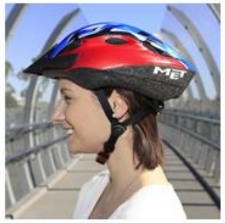
Ensure the straps join in a 'V' just below your ears.